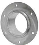
SLF RS bus